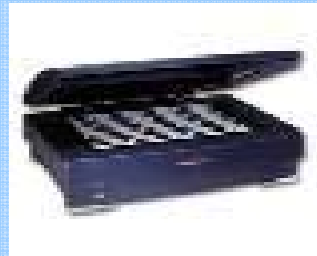
PL2100XL scanner w/UTA