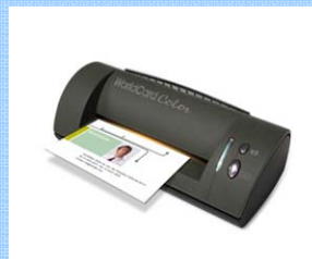
Color Business Card Scanner