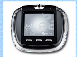
Penpower Diamond Jr.